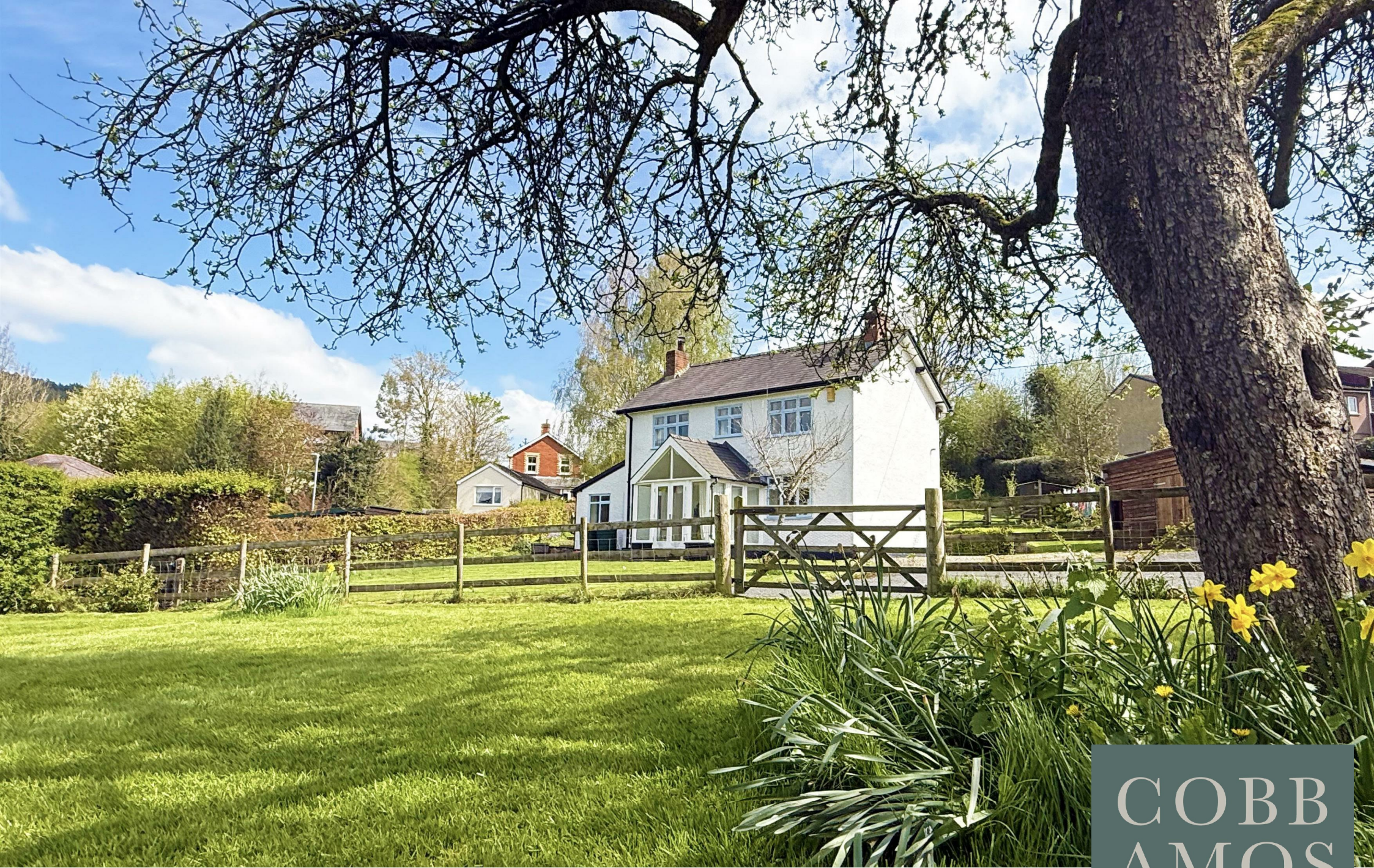
Oak Tree Cottage, Knucklas Road, Knighton, LD7 1UP Guide Price £500,000